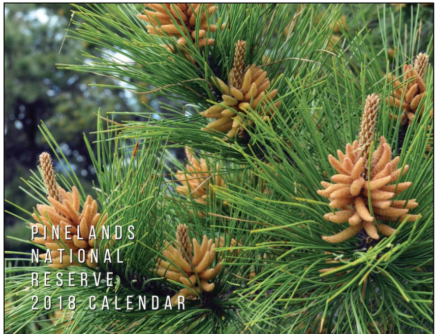
Above: The cover of the 2018 Pinelands National Reserve wall calendar.

Aside from the photos of the region's resources, the calendar includes State and Federal holidays, dates of Pinelands Commission meetings and important dates in Pinelands history.